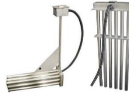
Electric Immersion Heaters