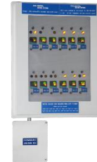
Nadcap compliant control system

Many modern day thermal processes require a high degree of temperature control and recording requirements produced by advanced process control systems . The investment has a quick ROI by reducing labor cost and increase process stability for predictable results.