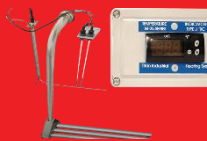
Sensors and Controls