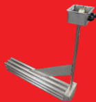
L-Shaped/Bottom Immersion Heaters