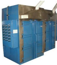
Oven with 36 temperature control zones